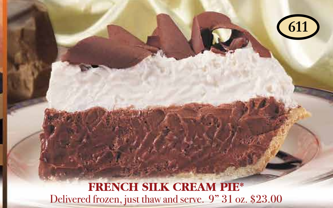
FRENCH SILK CREAM PIE*

Delivered frozen, just thaw and serve. 9" 31 oz. $23.00