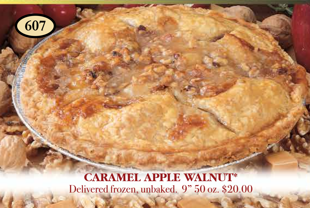
CARAMEL APPLE WALNUT*

Delivered frozen, unbaked. 9" 50 oz. $20.00